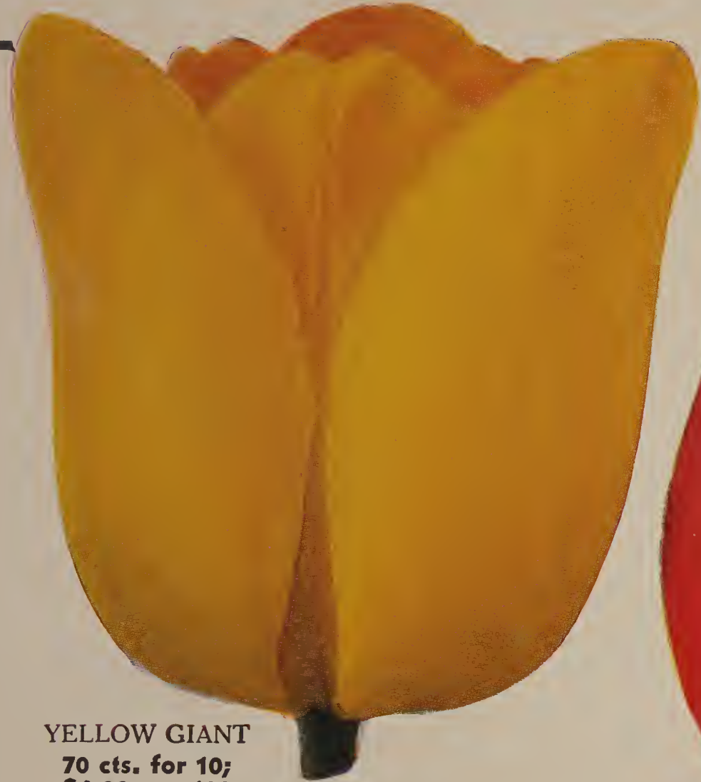
YELLOW GIANT 70 cts. for 10; $6.00 per 100 See page 12

In Tones of Lavender, Lilac, White, Pale Pink, and Rose